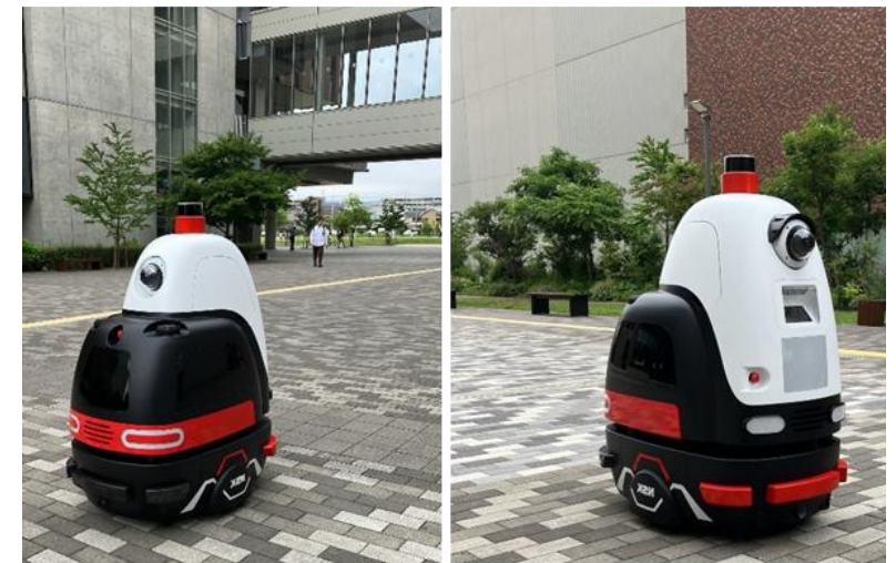
Scene from the field testing