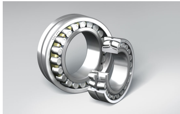
↑ NSK HPS Spherical Roller Bearing